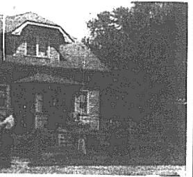
Home reported sold.