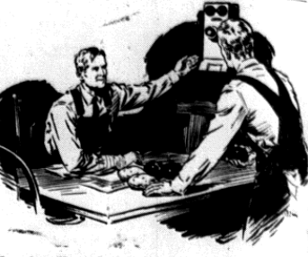
You Are Your Own Sales Manager, Mr. Farmer