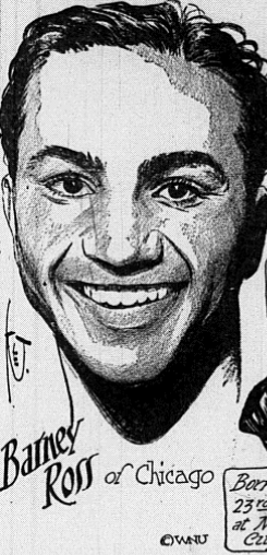
Barney Ross of Chicago Born Dec. 23rd, 1909, at New York City

BARNEY STARTED FIGHTING AS AN AMATEUR IN 1926. WON SIX GOLDEN GLOVE TITLES IN 1929 AND TURNED PROFESSIONAL. WON THE LIGHTWEIGHT CHAMPIONSHIP FROM CANZONERI IN 1933.