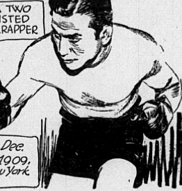
A TWO FISTED SCRAPPER