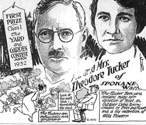
The Tucker Book yard contains many rare plants and flowers, and a big collection of wild flowers.