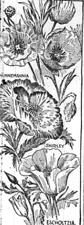
POPPIES ARE ONE OF THE FINEST OF GARDEN ANNUALS AND THE EASIEST TO GROW.

The village board has set aside May 18 and 19 for a village clean-up. The village board has set aside May 18 and 19 for a village clean-up.