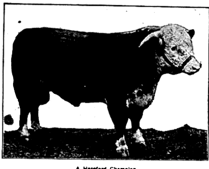
A Hereford Champion.

Do Not Try to Mix the Breeds and for Best Results Only One Kind Should be Kept—Shorthorn, Hereford and Aberdeen Angus Will Use Surplus Feed to Good Advantage.