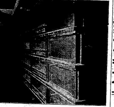
Paradise Brooder in the Collar.

Associate in Poultry Husbandry, University of Illinois. In the care of baby chicks, the right thing to do is to make them comfortable all of the time. Think for a moment how delicate must be the machinery of these little bodies which have been built up from the albumen of the egg mainly in the short period of 21 days.