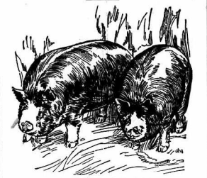
A Pair of Pigs Winning Berkshires.

Highly Recommended on Account of Good Disposition and Excellent Quality of Milk Favored—Sows are Better Mothers Than Average, Give Much Milk and Raise Large, Even Litters.