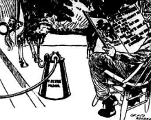
A New Jersey Congressman is Talking the Effect of Music on His Cow on Milk Time.

Roosevelt said that the British people should be more assertive in their actions.