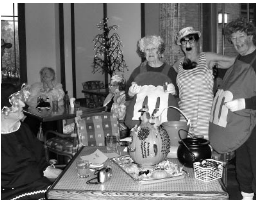
Bathing beauties and M&Ms show up at the Halloween party.