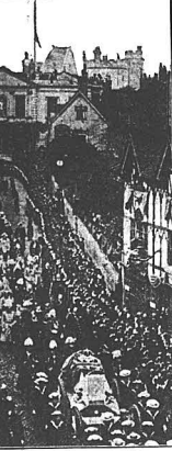
THE FUNERAL PROCESSION, AT WESTMINSTER, LONDON, KING EDWARD VII.