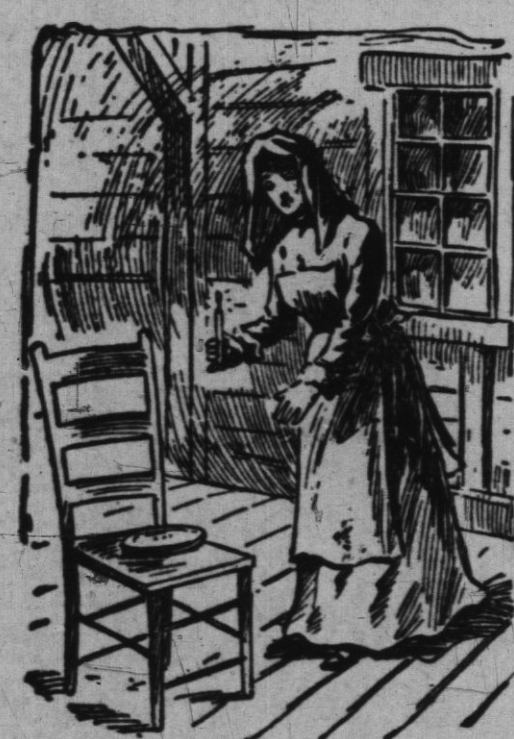
"I'll put the pie on the chair."

That evening a solitary figure stole up to a little side door of the mill. Nathan had often said he must have