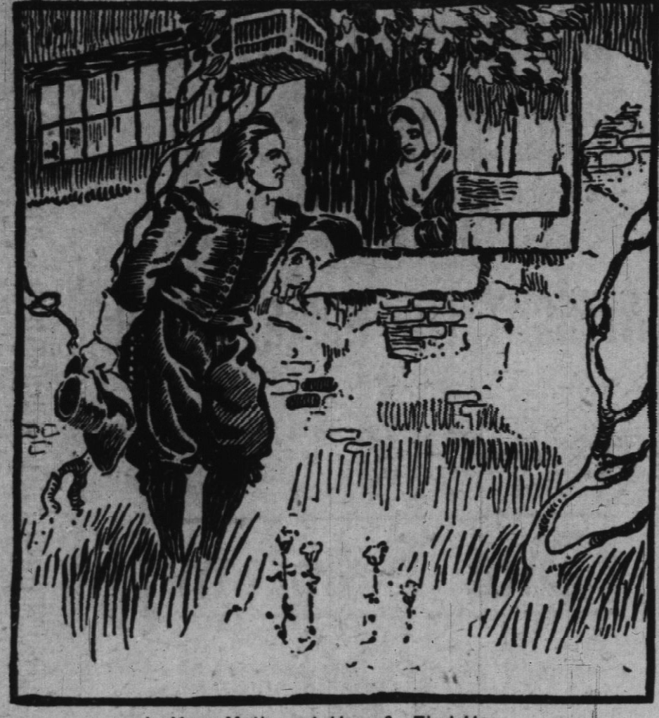
Is Your Mother at Home? Find Her.