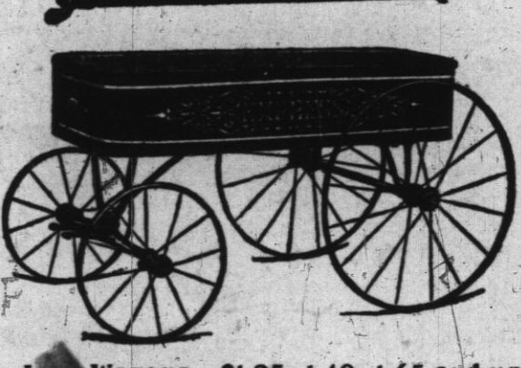
Wagons , $1.25, 1.40, 1.65 and up. 2.25, 2.95. Hardwood finish Wood Wagons 10c, 17, 25, 35 and up.