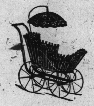
Doll Carriages, 25c $1.20,