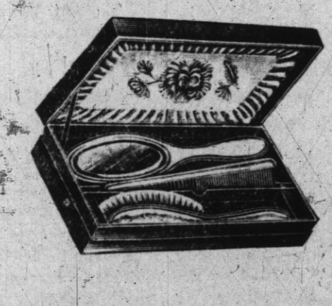
and up to $2.00.