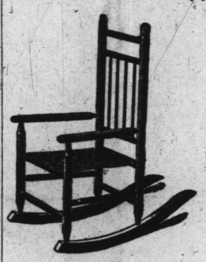
Rocking Chairs-25c, 30, 48, 85, $1.25, 1.45 and up