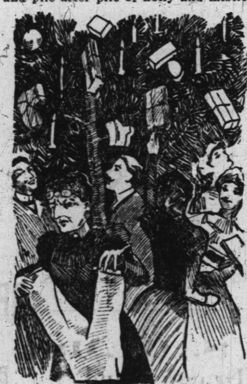
RECEIVED A PAIR OF HUNTING TROUSERS.

"The next morning we all arose at 8 o'clock, and after the jolliest kind of a breakfast, we hauled in great bunches of evergreen, reels of crow-foot moss, and pile after pile of holly and mistle-