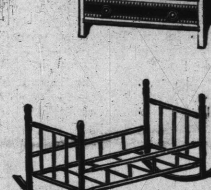
Cradles 25, 50c and up.