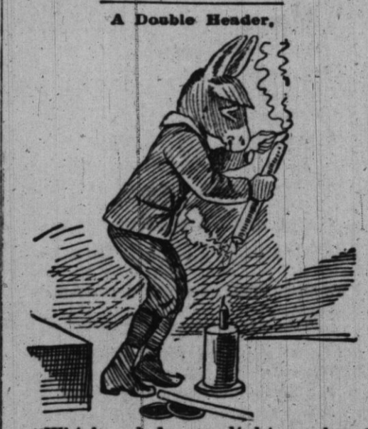
A Double Header.