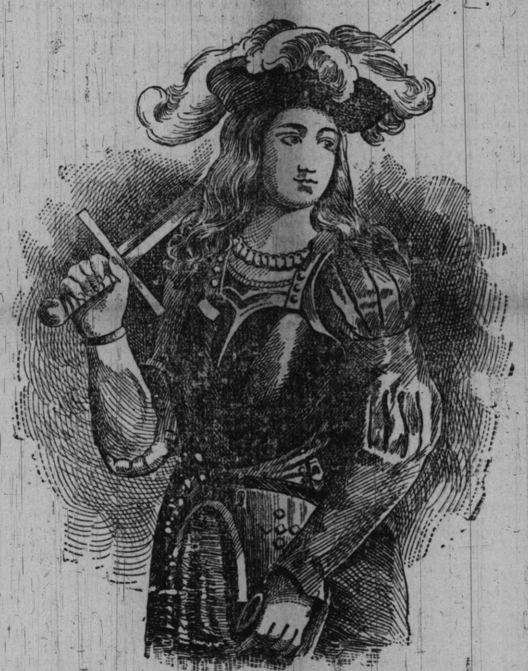
FROM THE PAINTING BY INGRESS, IN THE LOUVRE.